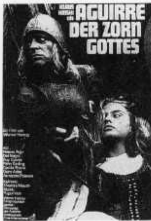
Figure 2 – Aguirre, the wrath of God (1972). Aguirre (played by Klaus Kinski) cradles his dying daughter Flores (played by Cecilia Rivera) in the final stages of the failed expedition.

A further issue is whether the striving to produce specific aesthetic images justifies any method of film production, and the way the resulting tensions help to expose the complicated relationship between politics and aesthetics in Herzog's work. Herzog's methods of film production have periodically met with hostility, most notably with his