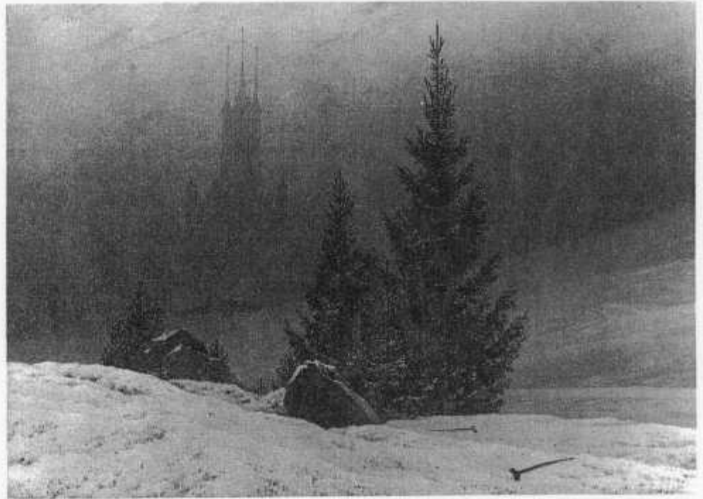
Figure 1 ~ Winter Landscape (1811) by Caspar David Friedrich. A typical romantic image from the early nineteenth century combining nature with religious imagery.

Herzog's films provide many familiar symbols from the classic era of German romanticism. In The enigma of Kaspar Hauser (1974) his imagery can be linked to the Biedermeier period of early nineteenth-century German romanticism exemplified by Caspar David Friedrich, Heine, Schiller, Schubert, and Schumann. 54 A typical example drawn from this period is Friedrich's Winter landscape (1811) (Figure 1), where we find a combination of the aesthetic and metaphysical sensibilities of the romantic tradition: the depiction of primordial nature through the darkness of the trees; the fascination with the aesthetic sublime depicted by snow in twilight; and the presence of religious imagery lending a spiritualized dimension to the aesthetic experience. In